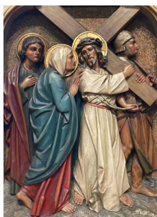
Jesus meets His mother