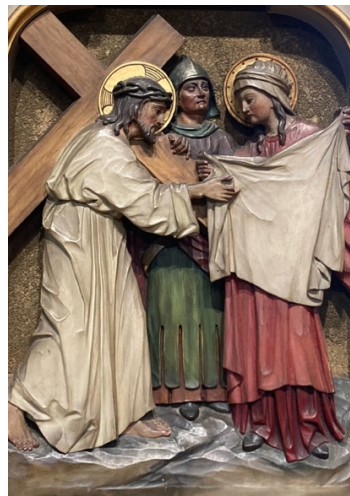
Veronica wipes the face of Jesus