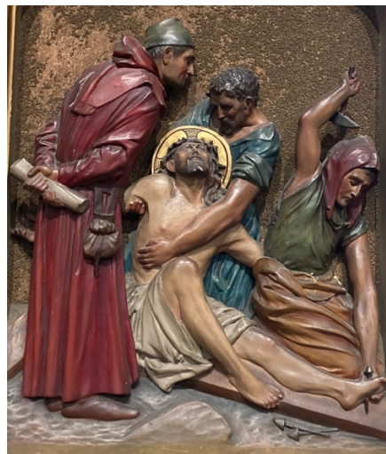
Jesus is nailed to the cross