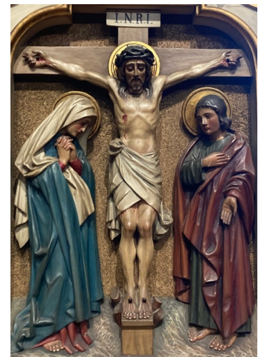
Jesus dies on the cross