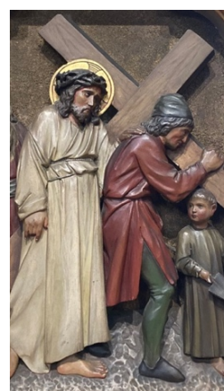
Simon of Cyrene helps Jesus to carry His cross