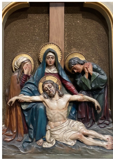
The body of Jesus is taken down from the cross