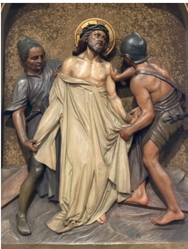
Jesus' clothes are taken