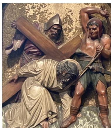
Jesus falls the first time