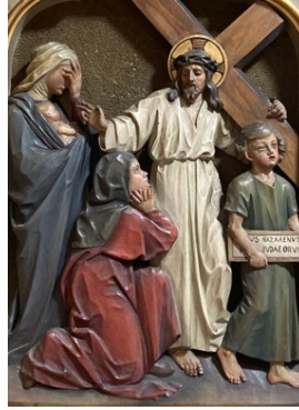
Jesus meets the women of Jerusalem