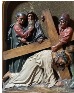
Jesus falls the second time

There is plenty to look forward to musically as Holy Week and Easter approach, but also a Save the Date: we will have a Parish Fundraising Concert on Saturday 6 June, featuring our choirs with solo contributions from the choral scholars and from other talented musicians - we look forward to seeing you there!