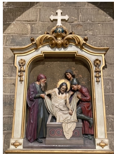
Jesus is laid in the tomb